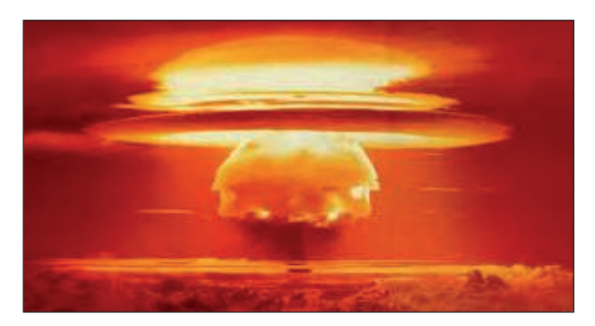
Castle Bravo nuclear test - March 1 1954