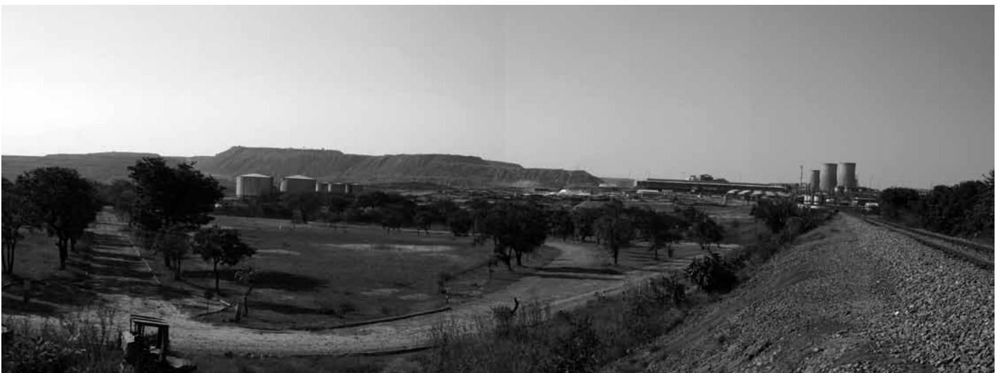
A copper mine near Chingola, Zambia.