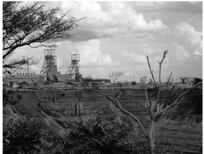
By Arne Wilson.

The government has also taken steps to protect workers' rights, with mixed results. In response to labor unrest, the Zambian government rebuked Chinese investors and asked Kabwe-based Chinese managers at Zambia-China Mulungushi Textiles, Ltd. to stop locking its workers in its factory at night in 2004. 74 In southern Zambia, authorities shut down Collum Coal