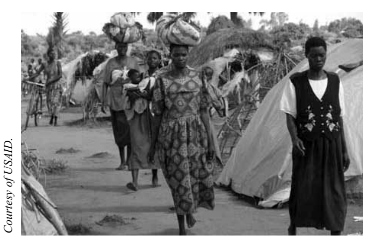
New arrivals at a camp for internally displaced persons in northern Uganda.

This in turn could spur the state to act, to seek assistance from organizations working on rule of law issues, and to work closely with an ICC that embraces the notion of positive complementarity.