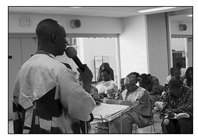
A pastor from Liberia was detained for three and a half months in a New Jersey immigration jail. He was denied parole and was only released after a U.S. immigration court granted him asylum.

denied his request for release on parole, even after an immigration court had ruled he was eligible for asylum. This refugee was finally released from detention two weeks after the judge's ruling was affirmed on appeal.