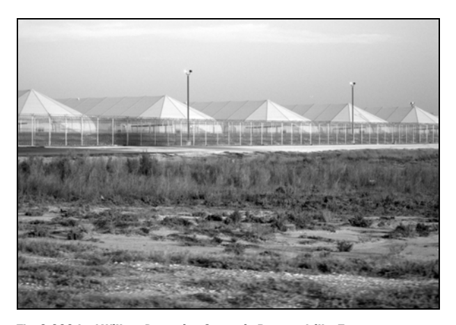
The 3,000-bed Willacy Detention Center in Raymondville, Texasnicknamed "Tent City" and "Ritmo"—opened in 2006.

As DHS and ICE have expanded immigration detention over the last few years, they have repeatedly chosen to detain asylum seekers and immigrants in new facilities that are located in areas that are not near pro bono legal resources, the immigration courts, and U.S. asylum offices. In too many instances, facilities used by ICE were opened or used for months or even years before a Legal Orientation Program was put in place to provide basic legal information to detainees—a decision which left thousands of asylum seekers and other immigrant detainees without basic legal information and counseling to help them