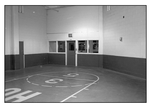
Many of the facilities lack meaningful outdoor space. This is the outdoor recreation area at the Hampton Roads Regional Jail in Virginia.

Lack of Privacy. In many of the detention centers and jails, asylum seekers have little or no privacy. Detainees are often housed in large "pods," or dormitories, some holding up to 100 people. At some facilities—like the Willacy, Pearsall, and Northwest detention centers, and the Piedmont county jail in Virginia—detainees sleep in narrow metal triple-bunk beds. (ICE has since stopped detaining asylum seekers and immigrants at the Piedmont jail; following the November 2008 death of an immigrant detainee who was held there, ICE transferred its detainees from the jail.) In some of the facilities, bathroom and toilet areas are separated from the living, sleeping and eating area only by a low wall. Toilet and shower stalls often do not have doors. This is the case at the Willacy and Pearsall detention centers in Texas, the Northwest Detention Center in Washington, and the Elizabeth Detention Center in New Jersey. At the Northwest Detention Center, some of the toilets are reported to be located next to the dining area.80