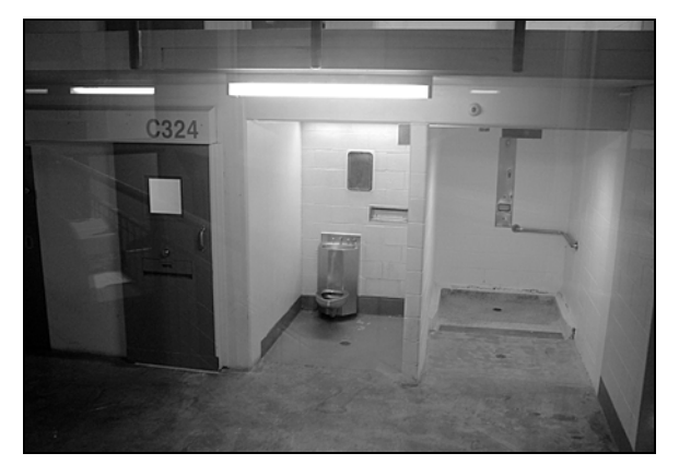
In many of the detention centers and jails, asylum seekers and other immigrant detainees have little or no privacy.

percent from fiscal year 2003 through fiscal year 2007, with the most growth occurring since 2005.62