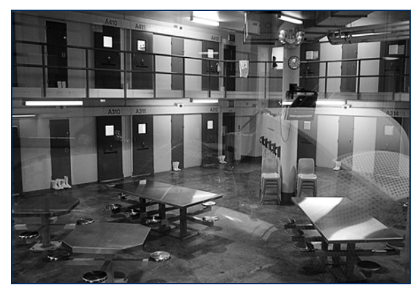
While detention averages $95 per day, alternatives to detention range from $10 to $14 a day, and release through parole has no financial cost each day.

Since 2005, ICE has increased the number of "beds" it uses to detain immigrants by 78 percent. <sup>239</sup> In the past four years, Congress has doubled the annual budget for ICE detention and removal operations to a current budget of $2.4 billion. Nearly 70 percent—or $1.7 billion—is devoted to "custody operations." <sup>240</sup> In fiscal year 2007 alone, ICE detained over 310,000 asylum seekers and immigrants, <sup>241</sup> and in fiscal year 2009, ICE planned to detain over 440,000. <sup>242</sup>