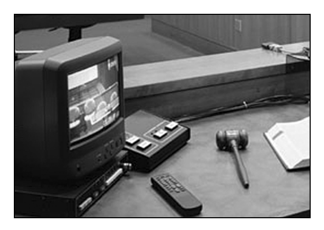
At some of the remote detention centers, asylum seekers often see U.S. immigration judges only on television sets.

When visiting both the 1,904-bed Pearsall facility and the now 3,000-bed Willacy facility, Human Rights First's delegation saw courtrooms that were centered around television sets, rather than live immigration judges. From our meetings with local immigration officials, pro bono attorneys and asylum seekers, Human Rights First learned that—during these video hearings—the asylum seeker may end up sitting essentially alone in the courtroom in front of the television set, or in some cases next to the government's trial attorney, while the judge sits in a courtroom at another location. If the asylum seeker is represented, his or her attorney must choose whether to sit next to the asylum seeker or whether to appear in person before the judge. One federal appeals court called this kind of choice a "Catch 22"—requiring an attorney to decide between the ability to confer with a client during a hearing and the opportunity to "interact effectively" with the judge and opposing counsel.315