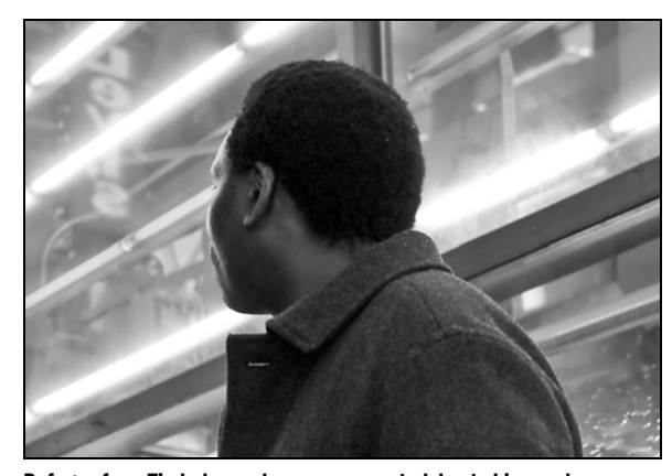
Refugee from Zimbabwe, who was persecuted due to his pro-democracy advocacy, and was detained at a U.S. immigration detention facility for over three months before being granted asylum.

DHS and ICE have increased their use of jail-like detention for asylum seekers and other immigrants by 62 percent since taking over responsibility for immigration enforcement in 2003. In 2002, the former INS used 20,662