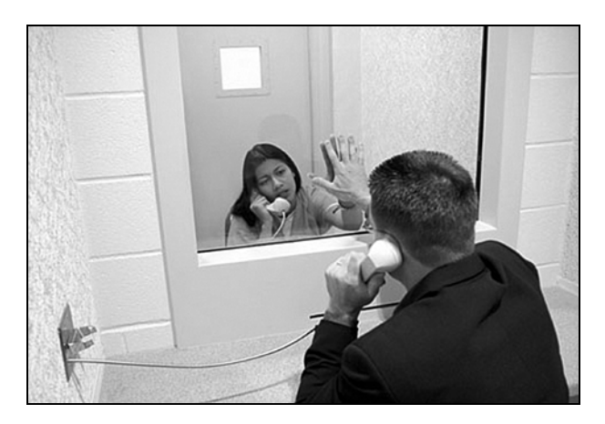
Many of the facilities do not allow detainees to have contact visits. Rather, detainees are only allowed to see their family and friends through plexi-glass.

Family Visits Through Partitions. Many of these facilities do not allow detainees to have contact visits with family or friends. At the Elizabeth Detention Center in New Jersey-a facility that exclusively holds non-criminal detaineesdetainees are only allowed to see their family members and friends through a thick sheet of glass, and can only speak to them through a phone. The Pearsall Detention Center, a 1,904-bed facility located in a sparsely populated area one hour from San Antonio, holds hundreds of asylum seekers from all over the world on any given day.86 Family and friends—who are likely to have traveled a great distance—are only allowed to visit their loved ones through a glass partition. None of the ICE-run and contract detention facilities allow for contact visits with family or friends, with the exception of the Broward Transitional Center.87 Facilities where contact visits with family and friends are not allowed include the Florence Service Processing Center in Florence, Arizona; the Hampton Roads Regional Jail in Hanover, Virginia; the Krome Service Processing Center in Miami; the Northwest Detention Center in Tacoma, Washington; the Varick Street Federal Detention Facility in New York City; and the Willacy Detention Center in Raymondville, Texas.