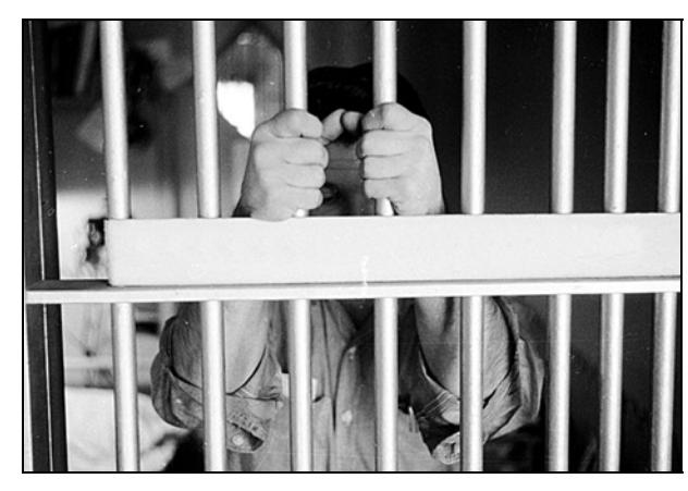
The psychological health of detained asylum seekers worsens the longer they remain in detention.

Numerous other studies have also confirmed that detention has a negative and sometimes lasting impact on the mental health of asylum seekers. For example, a 2006 study on the effects of detention on asylum seekers in Australia concluded that "prolonged detention exerts a long-term impact on the psychological well-being of refugees." The study also documented that the negative mental health effects of detention on asylum seekers "persist for a prolonged period after detention." 222