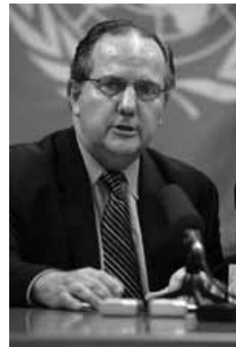
Juan E. Méndez

Although it may still be considered that the death penalty is not per se a violation of international law, my research suggests that international standards and practices are in fact moving in that direction. The ability of States to impose the death penalty without violating the prohibition of torture and CIDT is becoming increasingly restricted. Taking this into account, I have called upon all States to consider whether the use of the death penalty, as applied in the real world today, fails to respect the inherent dignity of the human person, causes severe mental and physical pain or suffering, and constitutes a violation of the prohibition of torture or CIDT.